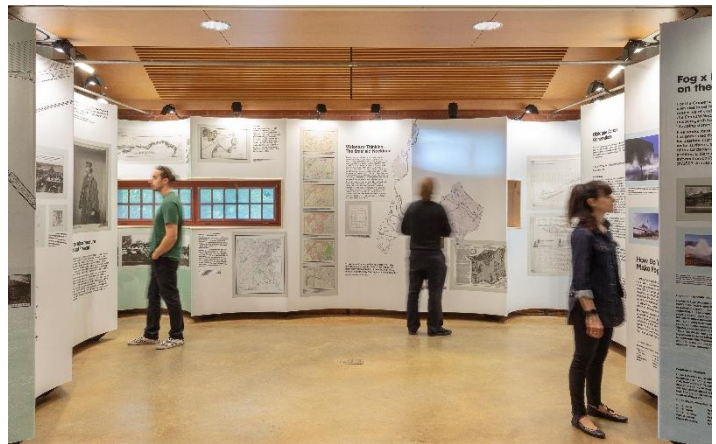
Left: newly installed utility box for electrical connection in Franklin Park. Right: visitors viewing exhibits at our Shattuck Visitor Center in the Back Bay Fens.