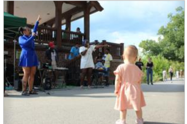
Left: community mural painting at an Olmsted bicentennial event. Right: a toddler enjoys live music at JP Porchfest at the Jamaica Plain Boat House.