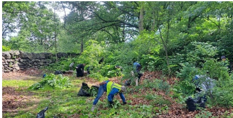
Left: map of trees inspected and pruned in Franklin Park in 2021 and 2022. Right: Volunteers removing invasive plants from Franklin Park.