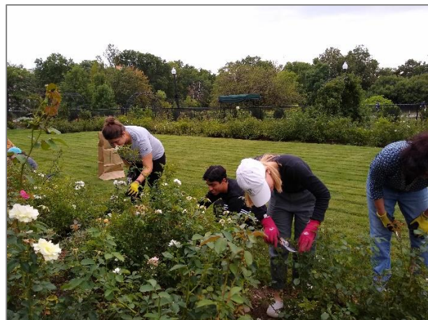
Volunteers working in the Kelleher Rose Garden.