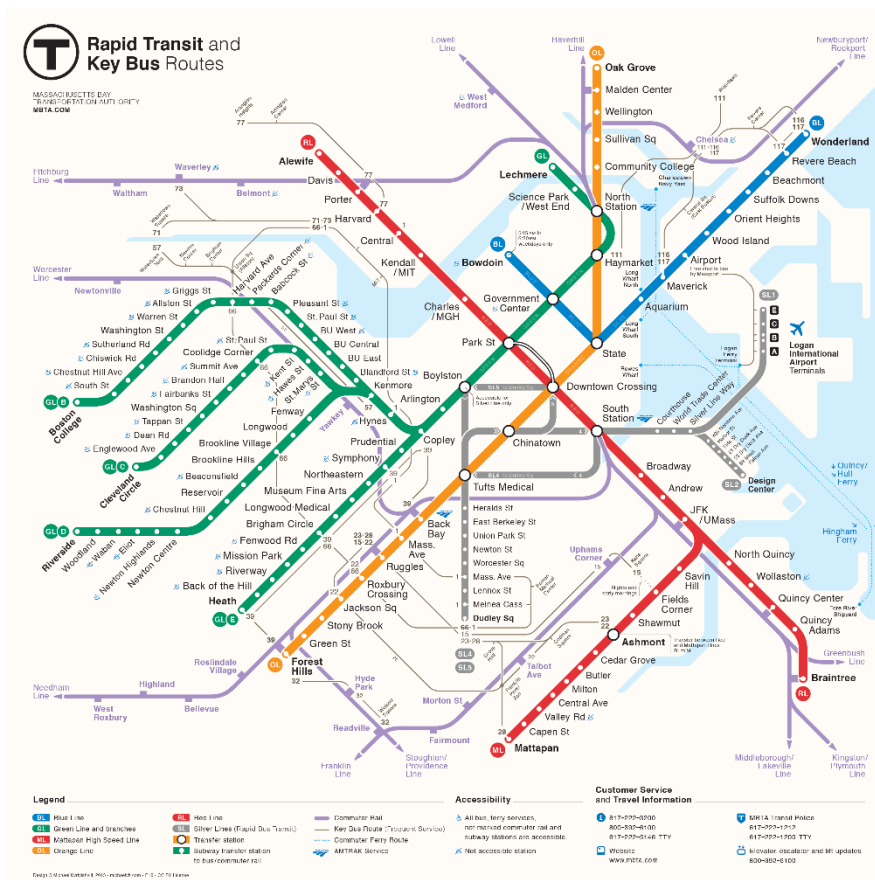
A map of the public transit routes in Boston

Get creative with your map! There are many ways to map put a place. Make your map your own! Here are some different ways people have mapped out Boston: