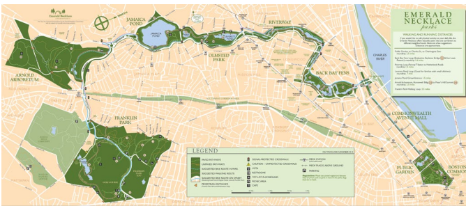
The Emerald Necklace

The 1,100-acre Emerald Necklace is home to many species of birds. With this guide, we will introduce some resources for beginning birders – the birds are for everyone , and you could start seeing them today!