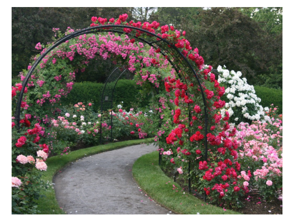
Rose Garden Visitor Pamphlet is provided by the Emerald Necklace Conservancy.

The Emerald Necklace Conservancy was created to protect, restore, maintain and promote the landscape, waterways and parkways of the Emerald Necklace park system as special places for people to visit and enjoy. The Conservancy's programs and funding support and complement initiatives by the City of Boston, the Town of Brookline, and the Commonwealth of Massachusetts.