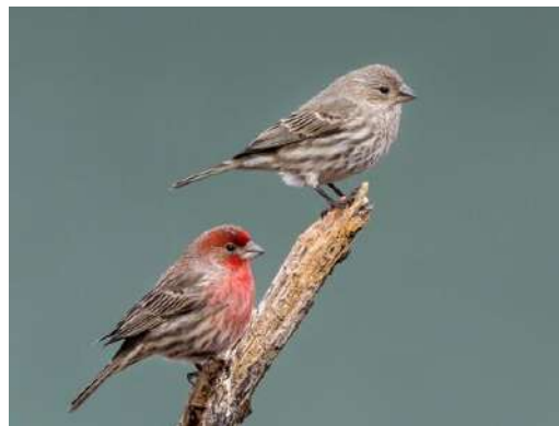
Male (left) and Female (right)

Fun Fact: the more pigment in the food that a male House Finch eats, the redder he will be, which female House Finches prefer