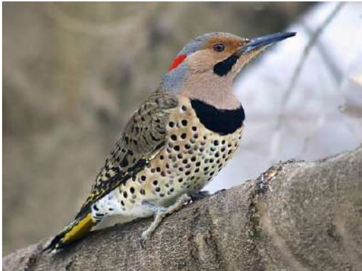
Adult Male (Yellow-shafted)

Fun Fact: Northern Flickers, like other woodpeckers, communicate and defend their territory by drumming on objects, with the goal of making as much noise as possible!