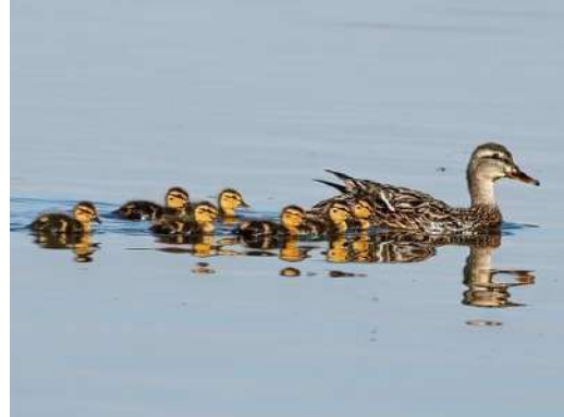
Female with Ducklings