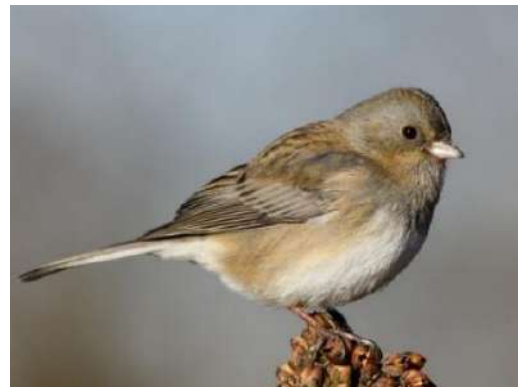
Female or Immature