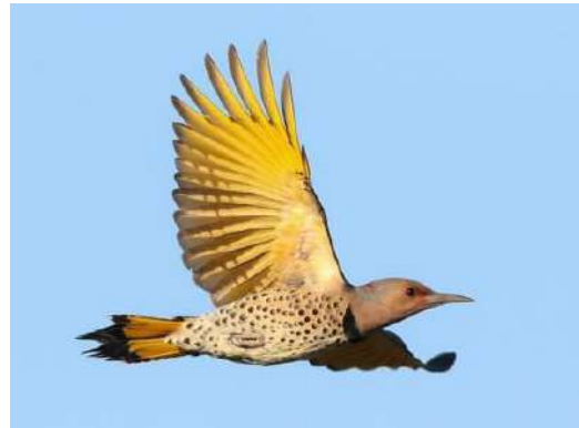
Adult Female (Yellow-shafted)