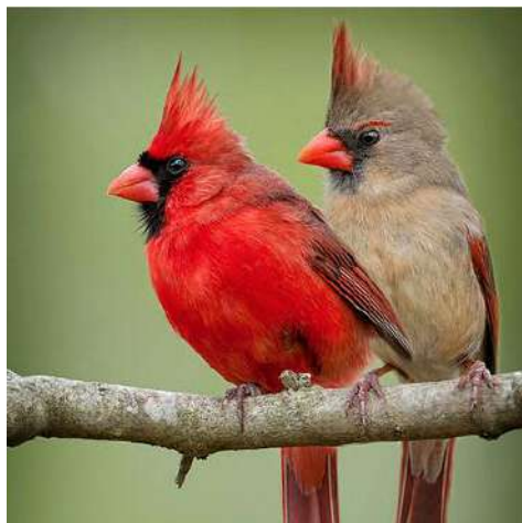
Male (left) and Female (right)

Fun fact: our only red-crested birds have a loud call that can sound like cheer, cheer and then a trill